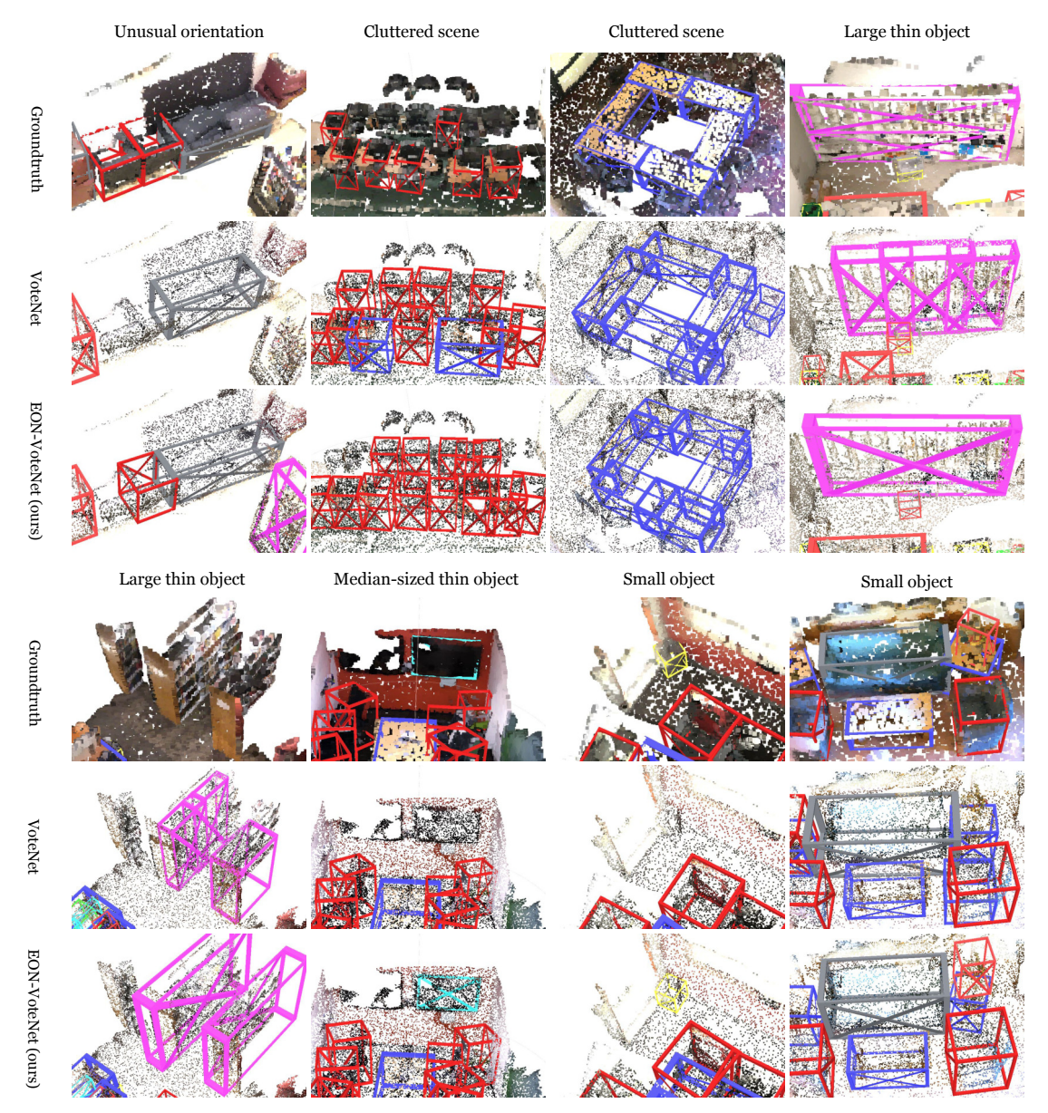
Figure 3. Qualitative results on ScanNetV2 dataset. Each row depicts a typical case where the object-level equivariance design shows promising improvements. Color information is not used for models, but only for visualization.